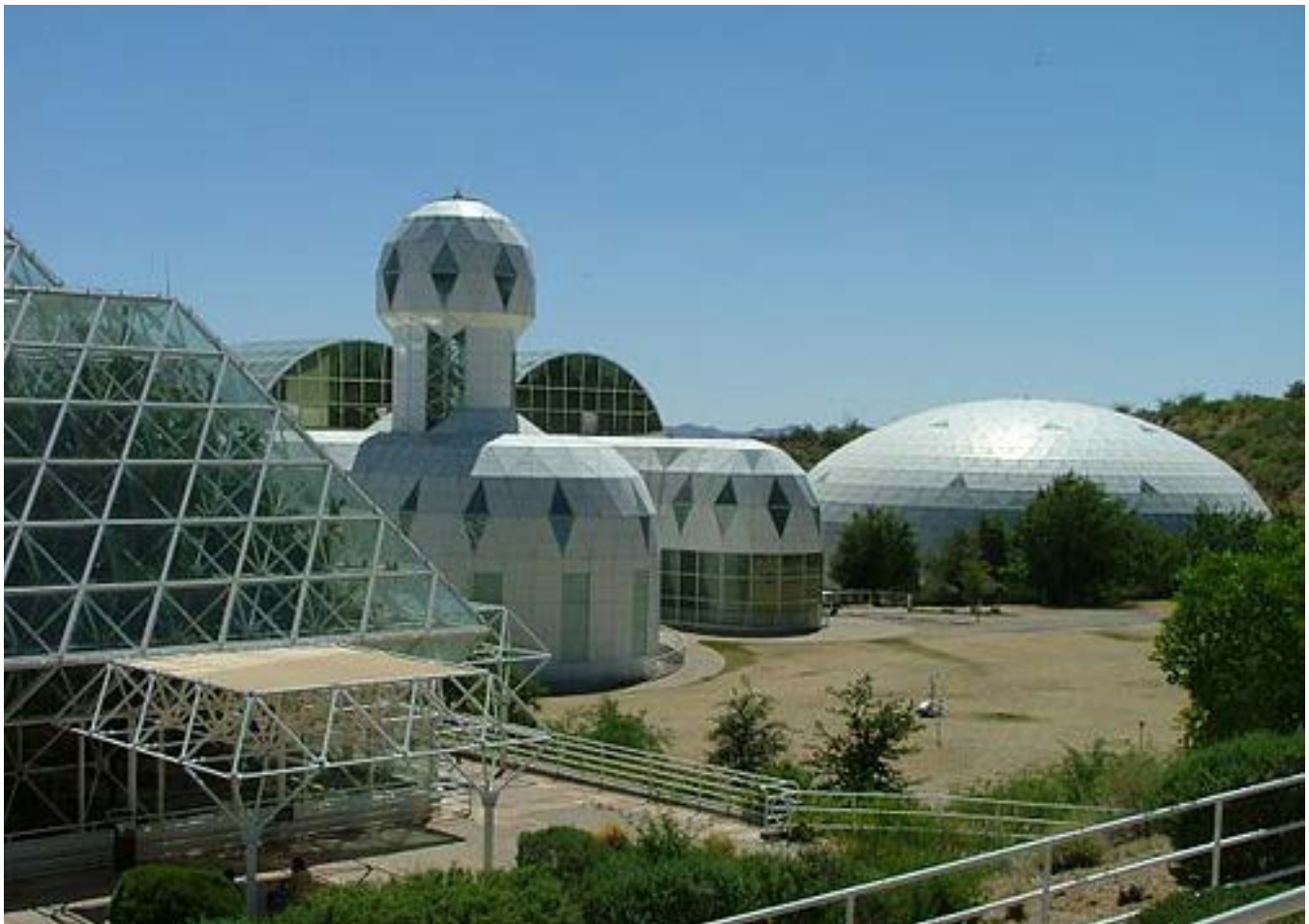
The Biosphere 2.

Enough compliments for now. Biosphere 2 was intended to show how humans could