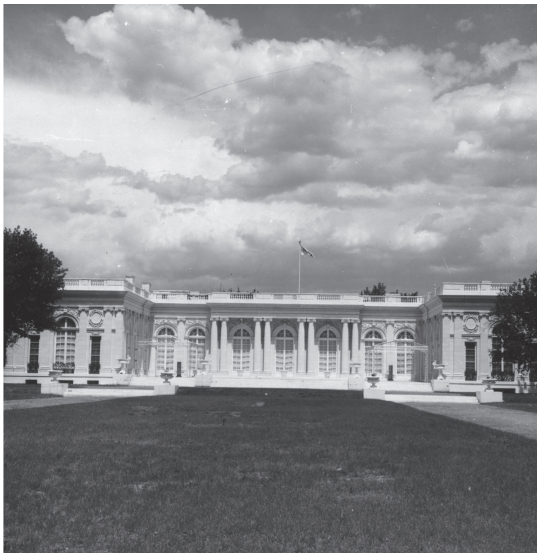
The Trianon