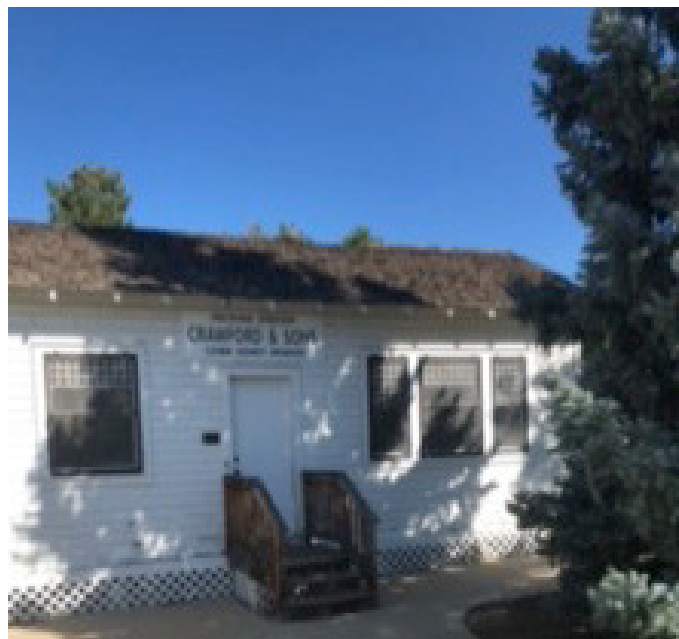
The Honey House