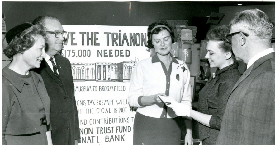
Trianon fundraiser, 1964

Most of the money raised by the Trianon Committee was returned to the donors; the committee recommended redirecting the refunds to Broomfield’s Mamie Doud Eisenhower Library. The library received a mere $637 from former Trianon donations, and eventually, Broomfield built its own mansions as it expanded north and east. §